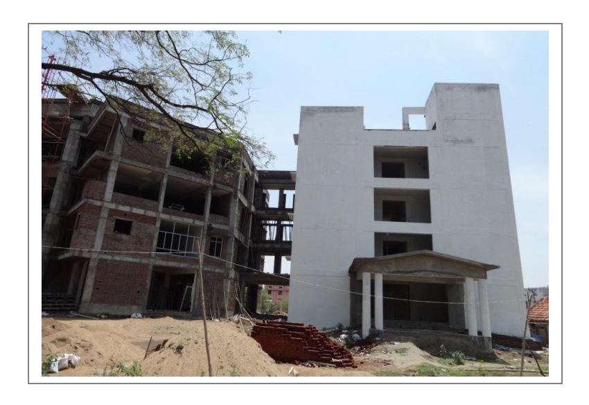
An Aerial View of Regional Judicial Academy, Coimbatore (Under Construction)